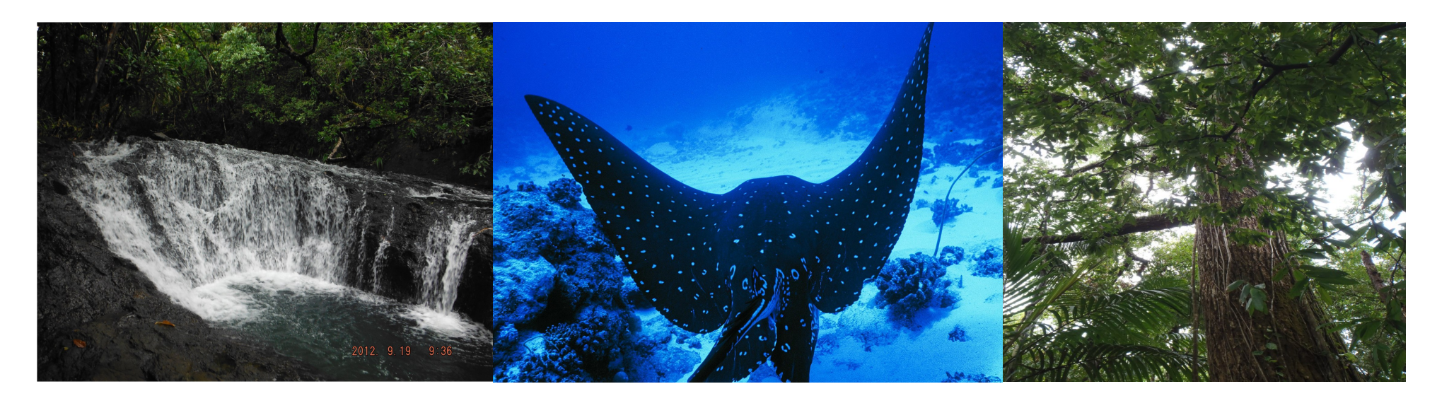
Ngchesar State Protected Areas | PAN Site Mesekelat and Ngelukes Conservation Area